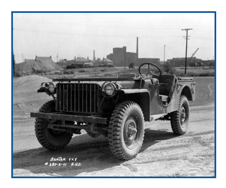
Bantam's BRC 40, pictured in 1941